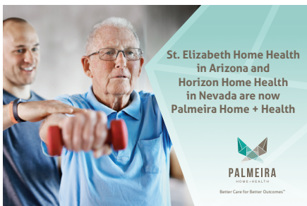
Direct Mail Postcard

Since the campaign's initial launch in 2018, Palmeira has already expanded its coverage into rural Arizona with the opening of a new office east of Phoenix. Double digit patient increases are being tracked through new physician and facility referrals and digital strategies are tracking increased consumer-direct leads from seniors recovering from hospital stays, recent surgeries or those with chronic health issues as well as their significant others and adult children decision-makers. Public relations efforts targeting general media as well as health care industry publications are beginning to create awareness and build credibility in the marketplace for Palmeira as a high quality, new option in the marketplace.